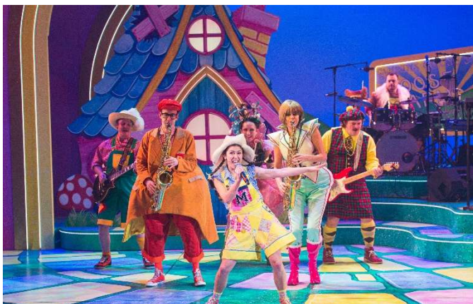
SONGS AND THE BAND

All the actors are also musicians, which means when we have a song in the show, they play lots of different instruments. They might wear different costumes for these parts or sit in the band area which is towards the top right-hand side of the stage.