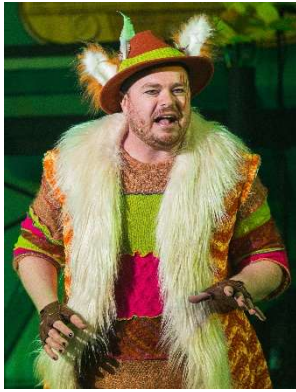
FREDDIE THE FOX