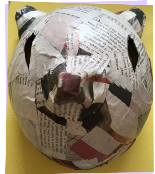
Y masg yn barod i'w addurno The mask ready to decorate