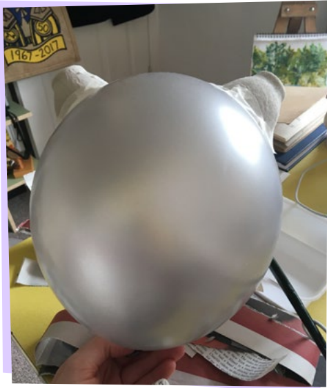
Balŵn a darnau o focs wyau fel clustiau Balloon with egg box pieces as ears