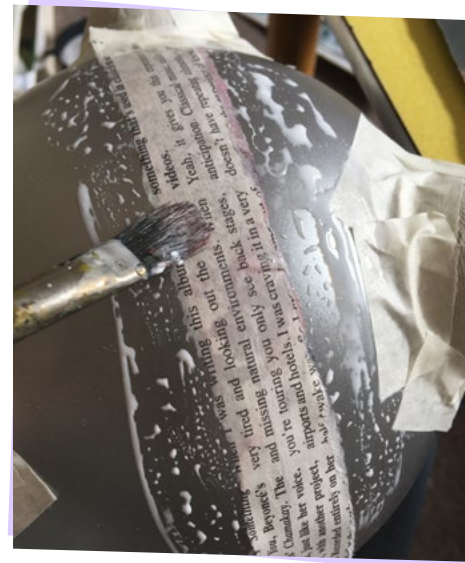
Dechrau rhoi haenau o lud a phapur Starting the layers of glue and paper