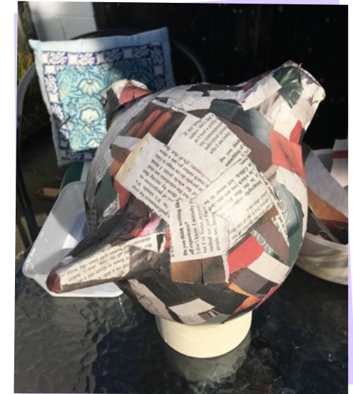
Gadael y masg i sychu dros nos Leaving the mask to dry overnight