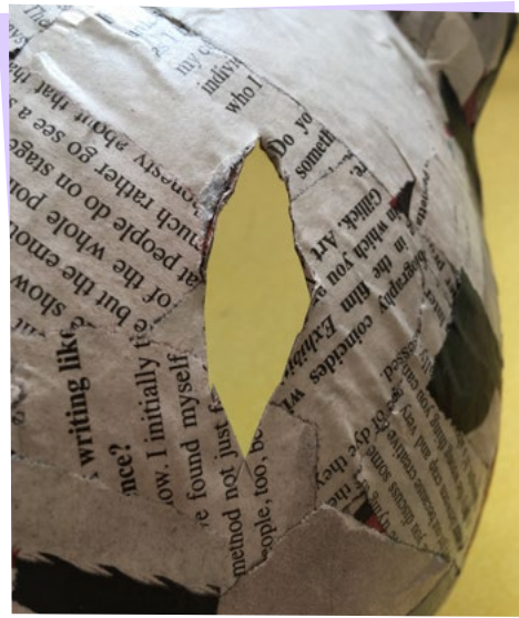
Torri tyllau i'r llygaid Cutting holes for the eyes