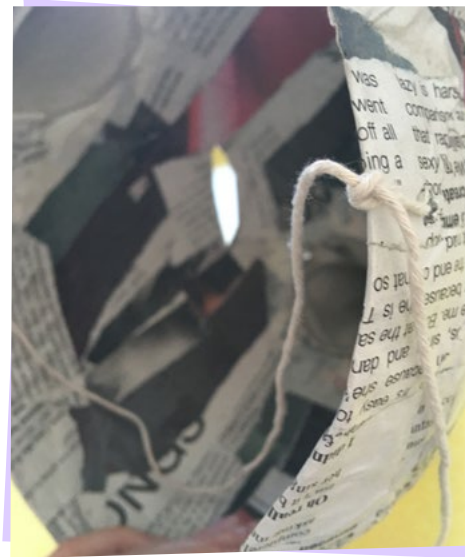
Llynyn sy'n dal y masg ar ein hwyneb String to hold the mask on our face