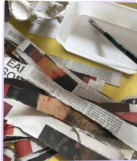
Torri sribedi papur newydd Cutting strips of newspaper