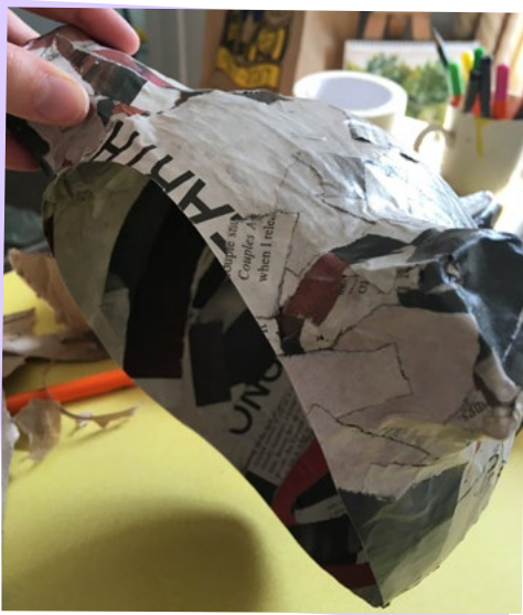
Tacluso ymylon y masg Tidying the edges of the mask